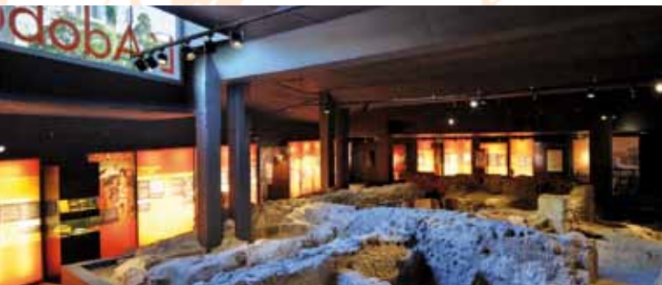
The entrance to the tannery in the Church Square.

It now belongs to the Catalan Network of Historical Tanneries which is made up of the Cal Granotes Tannery at the Igualada and Anoia Region Leather Museum, the Molí del Codina Tannery in Tàrrrega, the Art of Leather Museum in Vic, the Tanneries in Lleida and the Tannery in Granollers. Places of heritage that allow for a thorough and extensive interpretation of the work of the tanneries in Catalonia from the pre-industrial age to contemporary times.